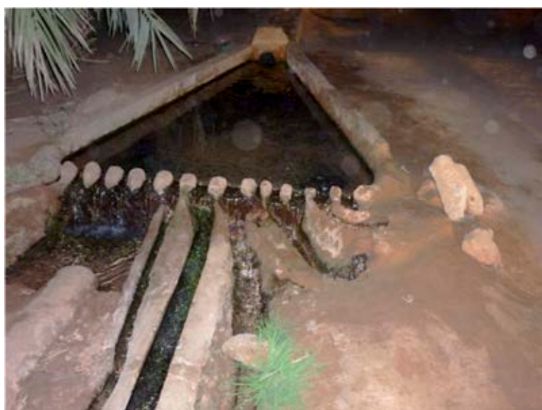
Figure 5. Foggara in Timimoun.