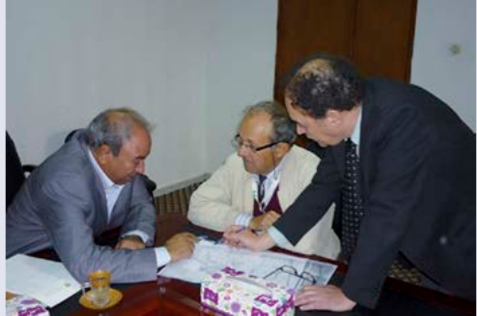
Figure 3. Developing the survey base with Libyan partners.