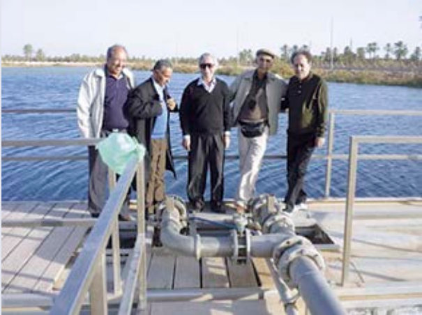
Figure 2. Selection of sites with the Libyan team.