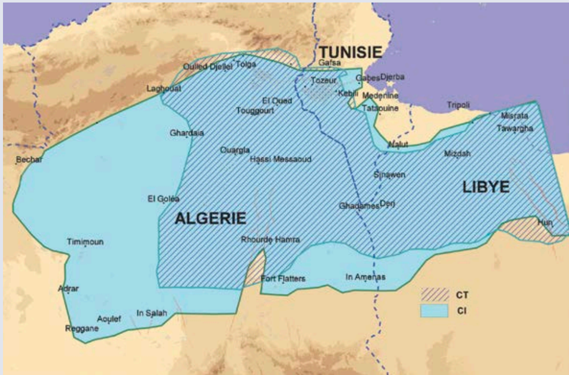
Figure 1. Map of the SASS basin.